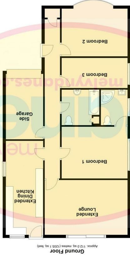
Total area: approx. 112.0 sq. metres (1205.1 sq. feet)